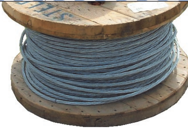
1/2" Galvanized Guide Cable 7 strand in reels of 1000' or 3000'. Weights approx. 510 lbs./1000'.