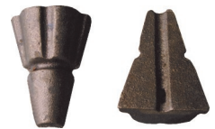
2-Piece Bronze Wedge Sets For use with splicers and turnbuckles