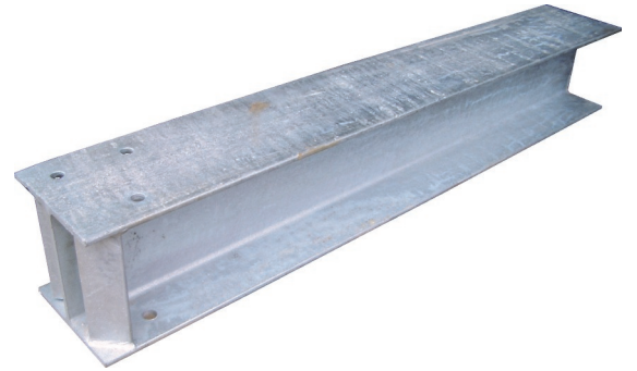
Guide Cable I-Beam Anchorage Hot-dipped galvanized wide flange beam with 6 holes and angle reinforcement. Also available set in 5000 lb. concrete anchor block on special order.