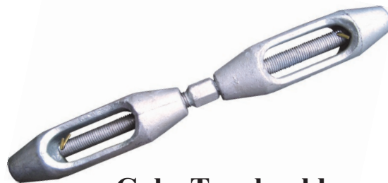
Galv. Turnbuckle c/w bronze wedges