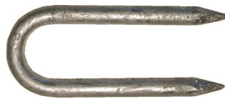
Galv. Staples 1" x 3". For use with cable spacers.