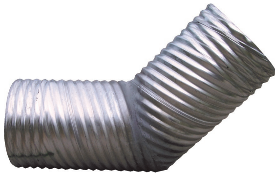
Single mitre elbow

Elbows, Tees, Crosses, Laterals, and Wyes in any diameter can be fabricated for specific requirements. Typical examples are illustrated.