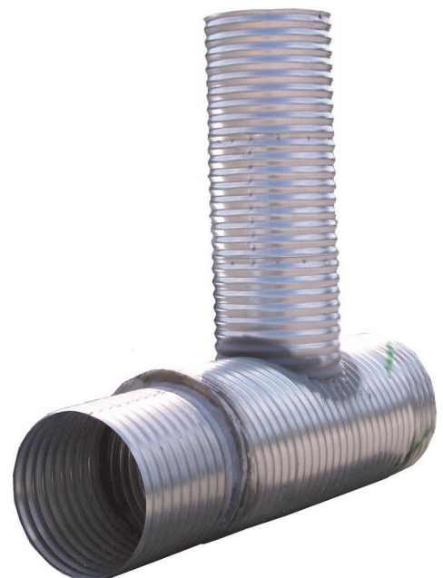
Reducer with drop inlet