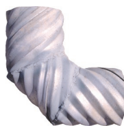
Double mitre elbow