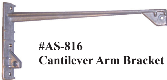
#AS-816 Cantilever Arm Bracket for Signs