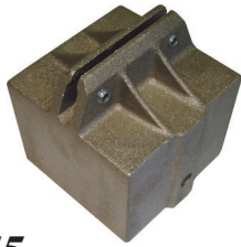
#AS-375 Square Post Cap To suit wood posts