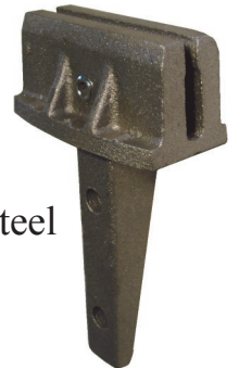
#UF-1 Sign holder For U-flange steel posts