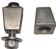
Cast Spacer For U-flange sign posts. Available with or without bolts, nuts, and washers.

In a variety of sizes and colours to suit your application. Available in Engineer, Hi-intensity, and Diamond Grade reflective.