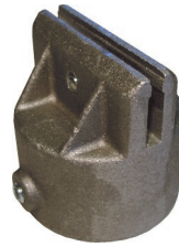
#AS-238 Round Post Cap To suit round steel posts