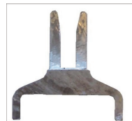
#AS-625 End Mount Bracket for Signs