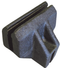
#AS-90 Cross Mounting Bracket Holds a second sign at 90° to the first