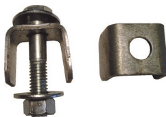
Galvanized Steel Spacer For U-flange sign posts. Available with or without