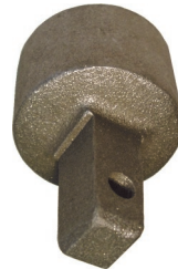
#AS-238A Post Adaptor Allows the round post cap to be used with U-flange posts