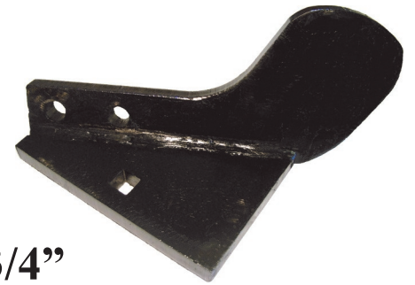
#011-3/4" Fabricated Steel Nose Piece

Nose Pieces to suit all popular makes of one-way snow plows (Frink, Champion, Viking, Everest, Craig, etc.) in a variety of materials to suit your application.