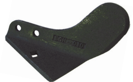
#ESH-010G Cast Grey Iron Nose Piece