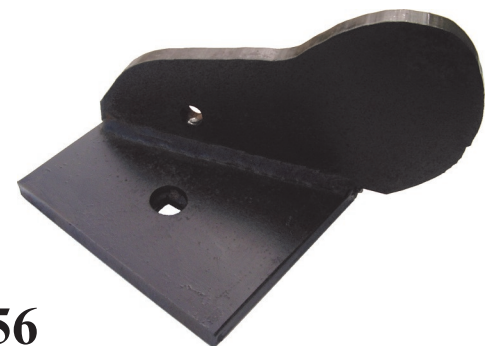
#1256 Fabricated Steel Nose Piece